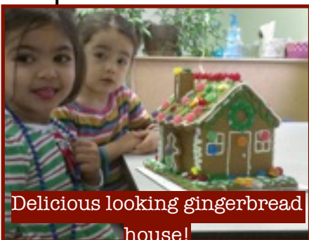
Delicious looking gingerbread house!