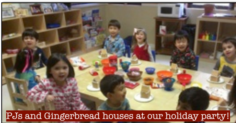
PJs and Gingerbread houses at our holiday party!